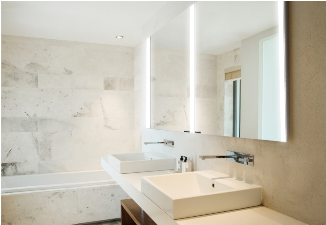
BUDGET-FRIENDLY BATHROOM REDESIGN FEATURING THE SIDLER MODELLO COLLECTION

Bathrooms and kitchens are the main areas of the house that most homeowners would love to remodel and update. However, both projects have a tendency to be costly. So, when saving costs is the primary goal, bathroom remodels can overrun and get out of control. Unless you just won the lottery or you have struck it rich, you will most likely need to stay within a certain budget for your bathroom upgrade. We would all love to have a beautiful, luxurious, spa-like bathroom space, but the reality is there is only a certain amount of money available for this dream remodel endeavour. However, dreams can come true as there are ways you can still renovate your bathroom while implementing budget-friendly measures.