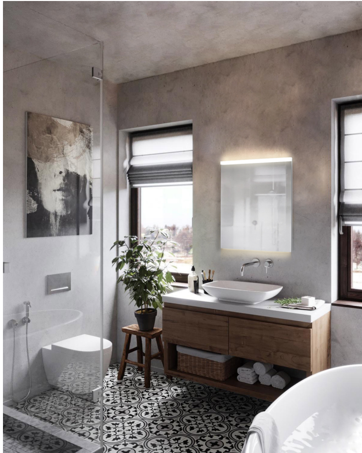
CREATIVE TEXTURED WALL PAINTED IN THIS BATHROOM DESIGN FEATURING THE XAMO COLLECTION

Another way to save on costs is simply to change the paint color in your bathroom. This simple change can make a surprisingly significant difference to your bathroom's overall appearance and refresh and modernize it. And the fun part is you can get creative and do more with paint than just cover a wall. For example, with creative painting you can paint textured effects using a mish mash of 2-3 different colours or you can create a faux wallpaper or tile look with paint and stencil. Or there are some cases where using the proper paint will enable you to paint over real tile. This will save money on the expensive cost to replace your current tile.