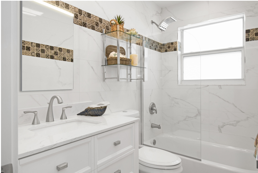
BUDGET-FRIENDLY WHITE TILE WITH HIGHER COST ACCENT TILE IN BATHROOM DESIGN FEATURING THE XAMO COLLECTION