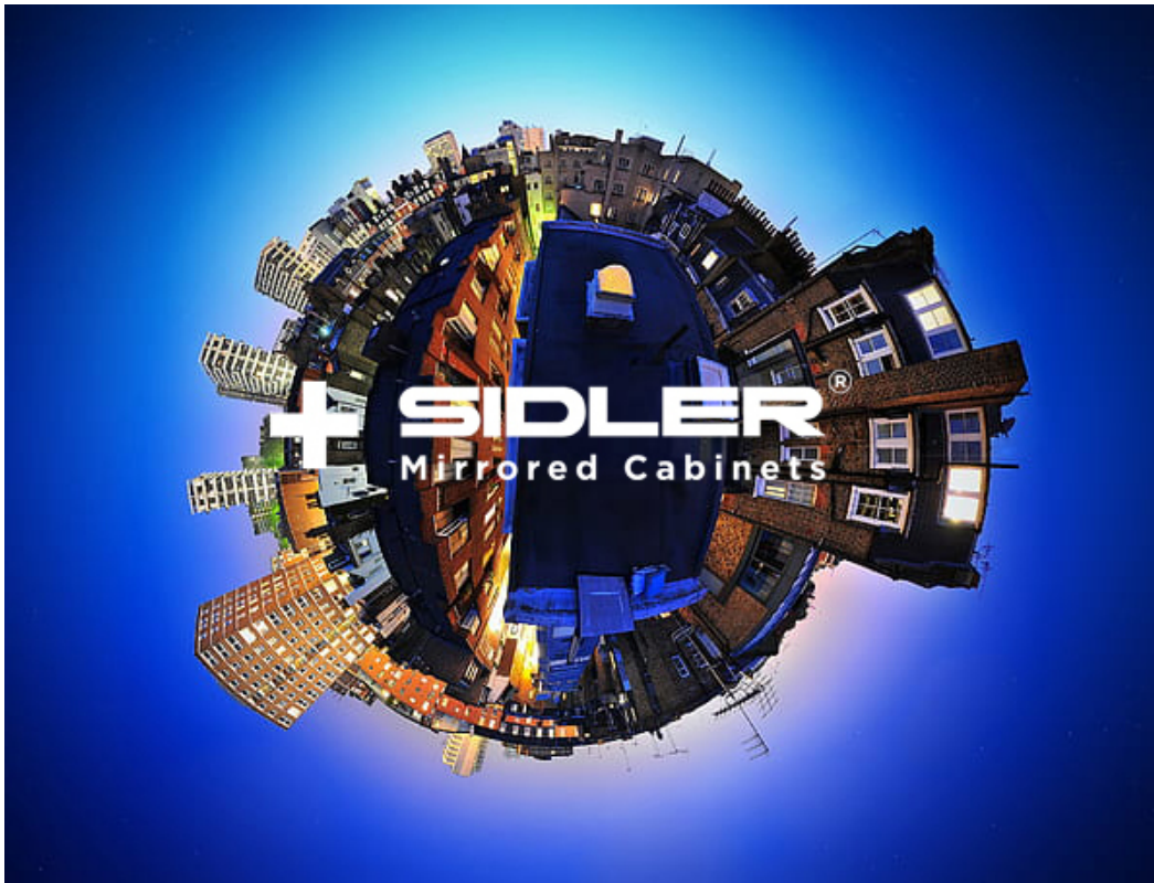
SIDLER MIRRORED CABINETS AROUND THE WORLD