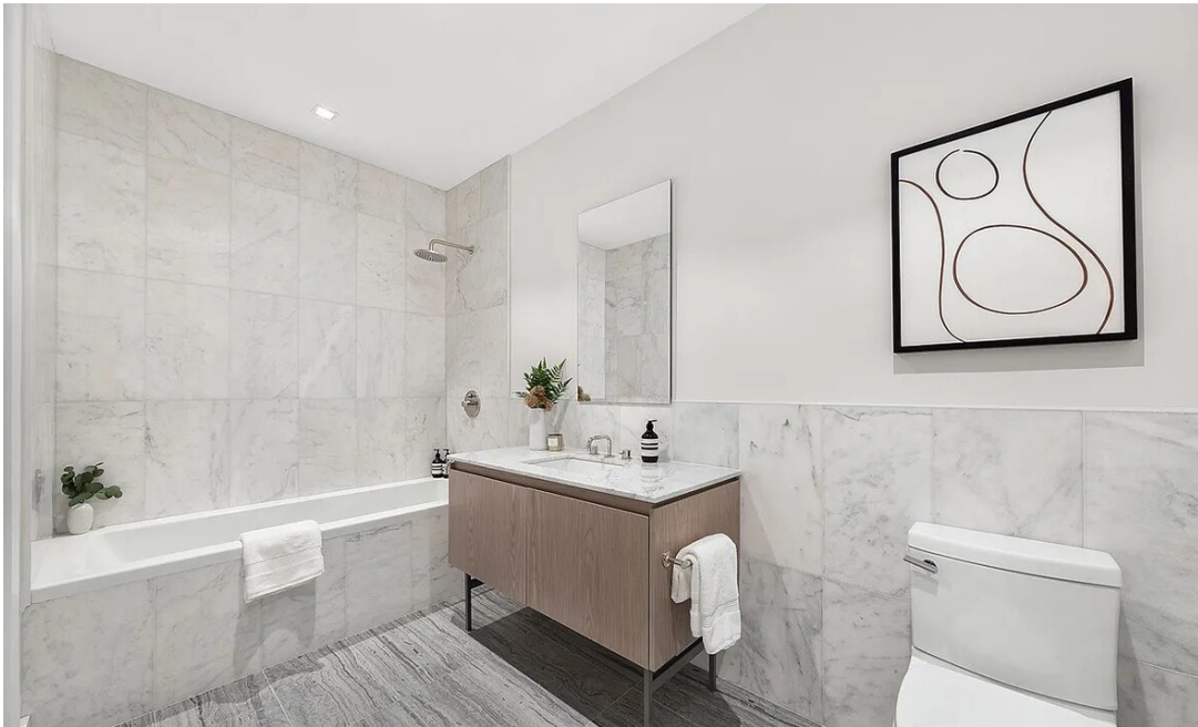
REFINISHED STANDARD BATHTUB IN BATHROOM DESIGN FEATURING THE MODELLO COLLECTION