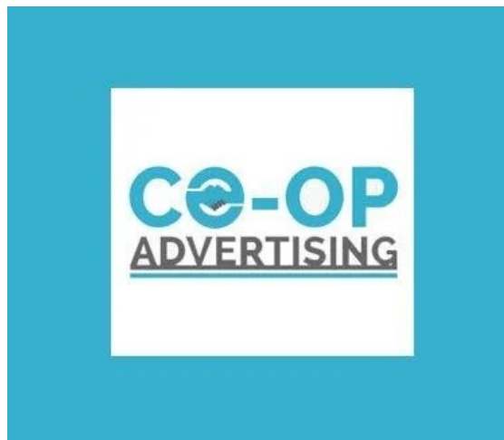
CO-OP ADVERTISING WITH SIDLER

ATTENTION TO OUR SIDLER DEALERS! We would like to collaborate on any joint marketing or co-op advertising opportunities with you!