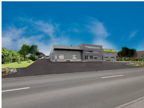
THE NEW SWISS OFFICE AND FACTORY, SWITZERLAND

We built a brand new office and factory at our European head office location in