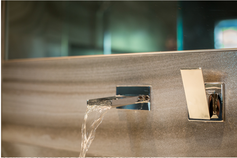
GRANVILLE STREET PROJECT - BY RODROZEN DESIGN + BUILD