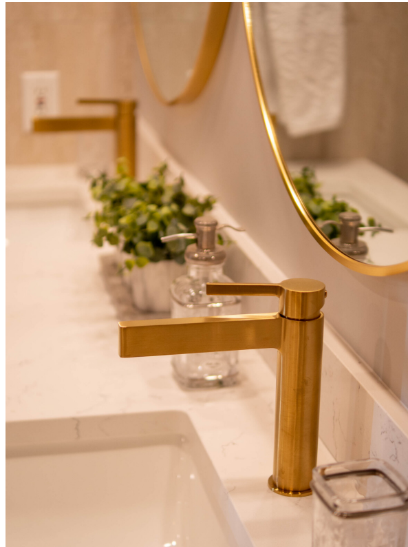
1383 MARINASIDE CRESCENT PROJECT - BY RODROZEN DESIGN + BUILD

We as designers look for specific products when designing an accessible bathroom. The American Disability Act is an association who provides a list of products that display the ADA logo , which indicates these products meet the requirements for accessible users. There is also an ADA requirement guide for Canada as well.