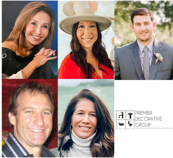
PREMIER DECORATIVE GROUP TEAM

Premier Decorative Group is a family-owned manufacturing representative and marketing group dedicated to offering the highest level of professionalism and integrity. They specialize in building relationships in a specific market segment. Their goal is to be the absolute best at what they do as partnership, trust, and Integrity are the key to their success!