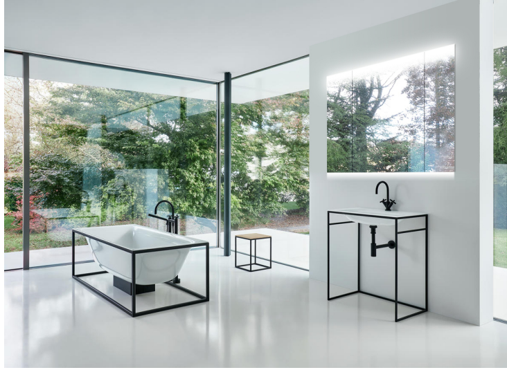
SIDLER® GRADIENT COLLECTION - TRIPLE DOOR 47" MİRRORED CABINET

The NEW SIDLER® Gradient collection with a unique innovative mirrored glass and light design from Swiss Industrial Designers STUDIOCOLONY Product Design .