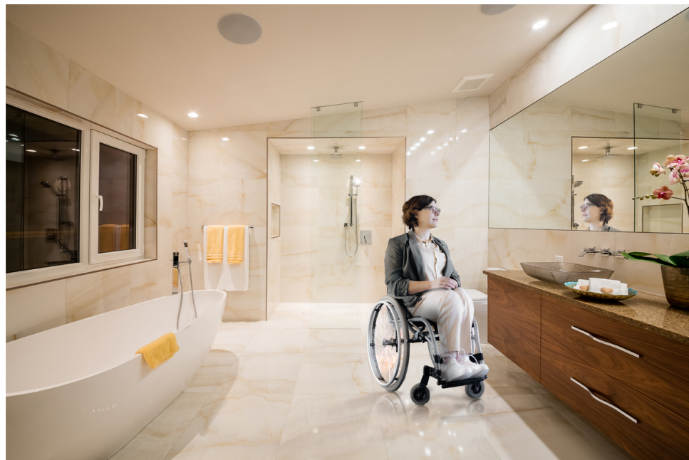
BURHILL AVENUE PROJECT - BY RODROZEN DESIGN + BUILD

For an adaptable bathroom, we design a bathroom space with less under the counter storage and drawers to provide enough wheelchair clearance underneath. Instead, we balance the storage capacity with some drawers under the counter and design storage space above or next to the counter. For