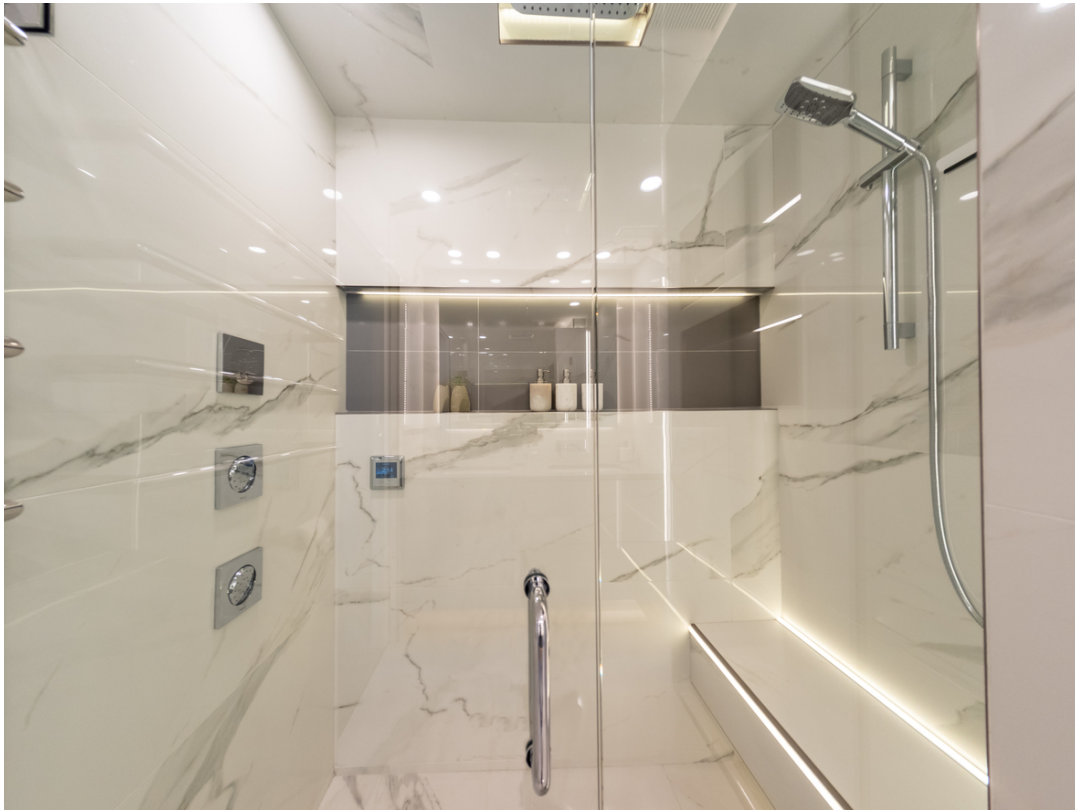
638 BEACH CRESCENT PROJECT - BY RODROZEN DESIGN + BUILD