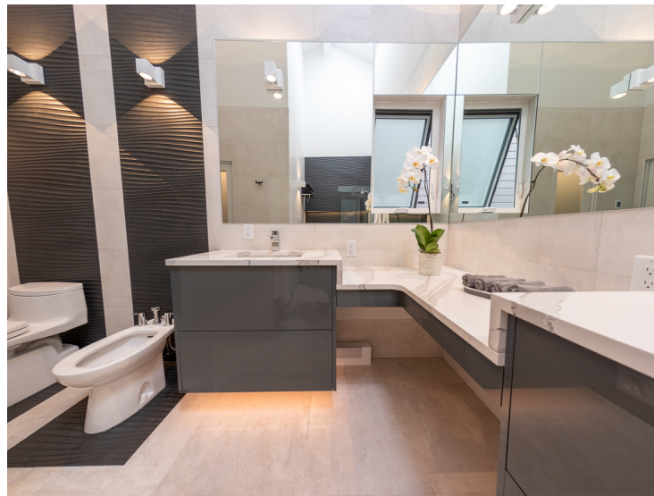
WEST 36TH AVENUE PROJECT - BY RODROZEN DESIGN + BUILD

With some of the requirements of accessible bathroom features, we also need to ensure we do not compromise on the aesthetics of a design. Typically, there will be drawers under a basin, which is utilized to hide the unsightly plumbing underneath. However, for accessibility, the area under a basin must be kept free and unobstructed. And in some cases, this can create an unappealing design with these exposed pipes, etc. We work around these challenges by using fixtures that cover unsightly plumbing while ensuring space under the sink for a wheelchair user.