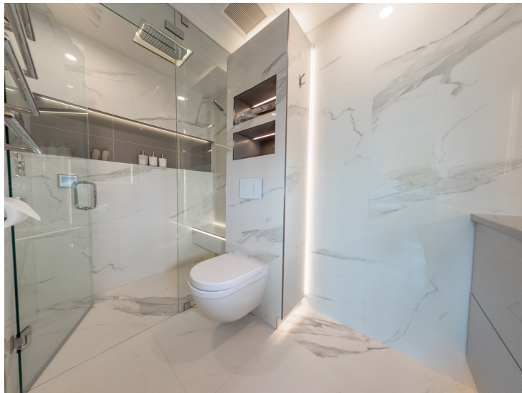
638 BEACH CRESCENT PROJECT - BY RODROZEN DESIGN + BUILD

As well, the evolution of technology offers many advancements where ‘smart’ home systems can now be easily controlled from a mobile device for wheelchair users who can easily use a phone or, there are voice activated systems to accommodate those who require this feature.