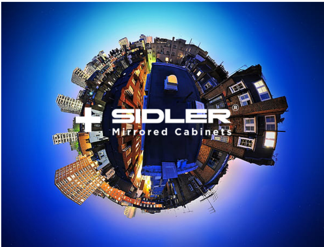
SIDLER MIRRORED CABINETS AROUND THE WORLD