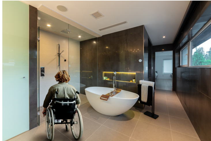
HIGHLAND BOULEVARD PROJECT - BY RODROZEN DESIGN + BUILD

can reach them more easily. We also ensure fixtures are installed within reach of a basin or toilet.