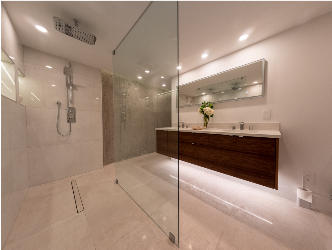
503 WEST 16TH AVENUE PROJECT - BY RODROZEN DESIGN + BUILD