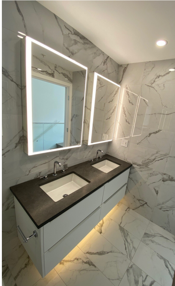
SIDLER QUADRO MİRRORED CABINET FEATURED IN KAI KITSILANO MULTI-RESIDENTIAL PROJECT, VANCOUVER BC

example, when we incorporate storage above the counterspace, we will add a mirrored cabinet in order to maximize the functionality of not only providing adequate storage space, but to also have this storage function as a mirror, and in some cases overhead lighting.