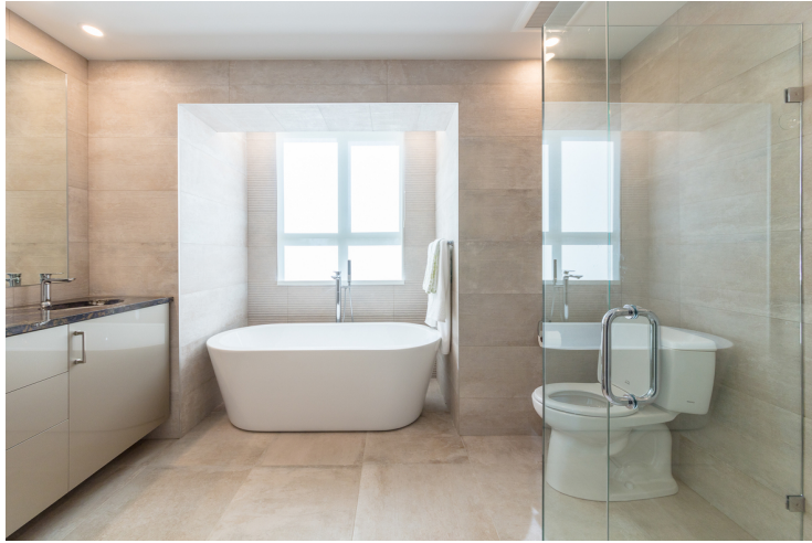
WEST 13TH AVENUE PROJECT - BY RODROZEN DESIGN + BUILD

For example, the toilet needs space around it to ensure wheelchair users can position themselves next to the toilet before transferring across. Another example is the height of a bathroom vanity counter. Have you ever walked into a bank and noticed the teller counter is a bit taller than the average desk height of 30" tall. There is a careful reason for this. Countertop heights are also required to be at a certain level considered optimal for a wheelchair user. The standard countertop height for wheelchair allowances is 36". This countertop height allows for accessibility underneath for a wheelchair while also ensuring the wheelchair user has enough room to operate the handles or reach for objects