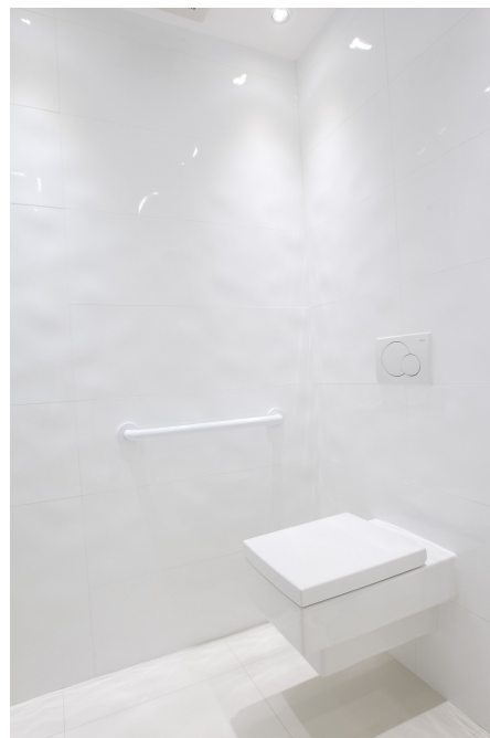
ACCESSIBLE TOILET WITH GRAB BAR - BY RODROZEN DESIGN + BUILD

When installing accessible doors for a wheelchair user, we must ensure that the door design swings away from the user as much as possible. This allows the wheelchair user unobstructed and easy access into and out of the bathroom or a shower. Therefore, we design the bathroom flow to maximize room for doors to swing outward and away as much as possible. Also, much like what you see in commercial designs, we can also include automatic doors or 'smart' door designs with switches to open and close doors.