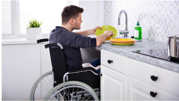
MAN IN WHEELCHAIR WASHING DISHES IN ACCESSIBLE KITCHEN DESIGN

And how a home space or more specifically, a bathroom space is designed plays a role in creating an accessible, safe, and independent lifestyle for wheelchair users.