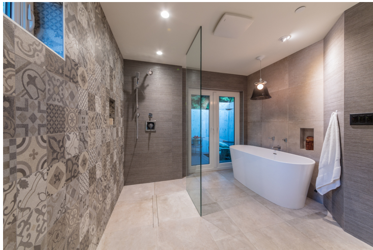
RAVEN PLACE PROJECT - BY RODROZEN DESIGN + BUILD

The best shower for a wheelchair user is one without a door. So, we often utilize glass partitions in our walk-in showers to minimize water spread while allowing a wheelchair user to get in and out without opening any glass doors. Or if a door is added, it is a 'smart' door which can swing out wide and outward with an automatic open and close function.