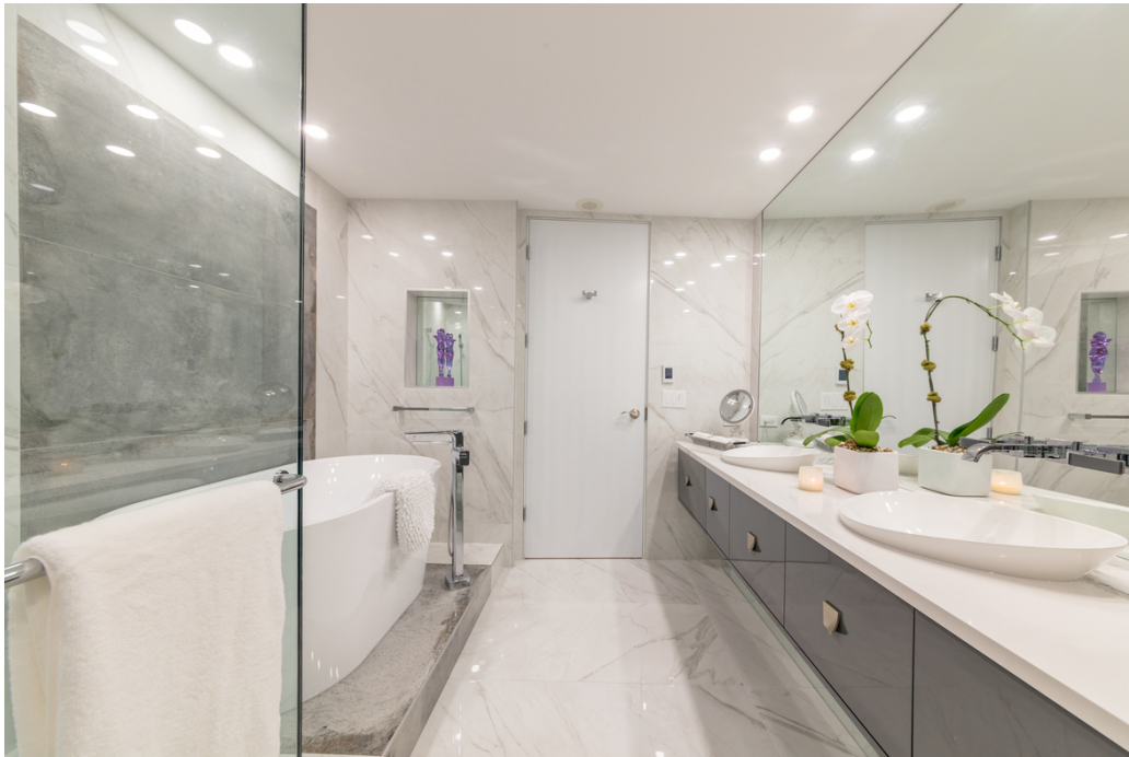
938 NELSON STREET PROJECT - BY RODROZEN DESIGN + BUILD