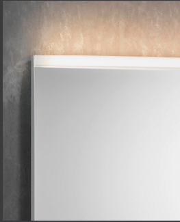
INTEGRATED LED LIGHTING SYSTEM