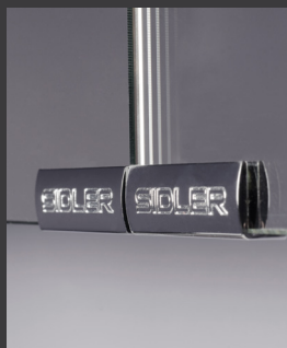
UNDERSTATED ALUMINUM HANDLES