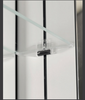
PATENTED SHELF ADJUSTMENT SYSTEM