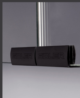
UNDERSTATED MATTE BLACK HANDLES

*DIMMABLE WITH A LOW VOLTAGE (0-10V) DIMMER SWITCH