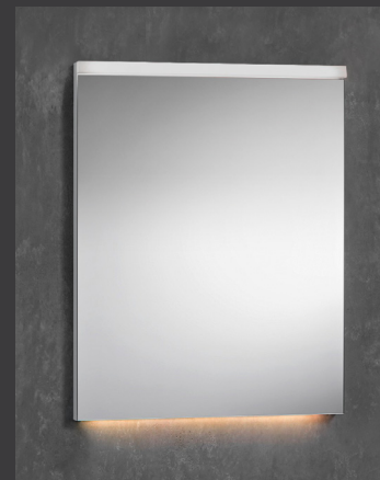
NIGHT LIGHT FUNCTION OPTION

Please download the specific datasheet on sidler-international.com