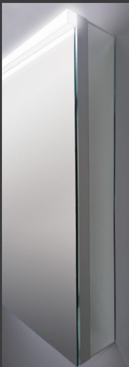
SIDE MIRROR KIT FOR SURFACE MOUNTING