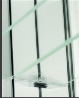
ANODIZED ALUMINUM BODY