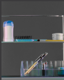
MIRRORED CABINET BACK WALL