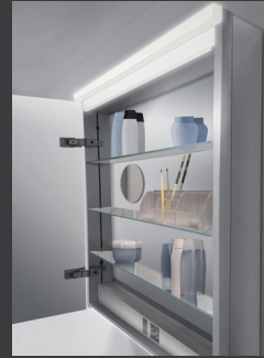
FUNCTIONAL STORAGE SOLUTION