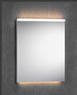
3000K TEMPERATURE LIGHT