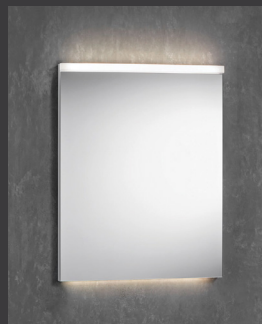
4000K TEMPERATURE LIGHT