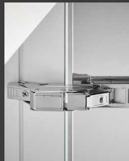
CONCEALED BLUM® SOFT-CLOSE HINGES