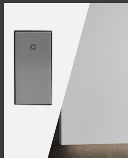
NIGHT LIGHT FUNCTION