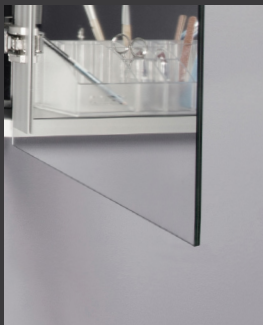
SILVERLASTING™ DOUBLE-SIDED MIRROR DOOR