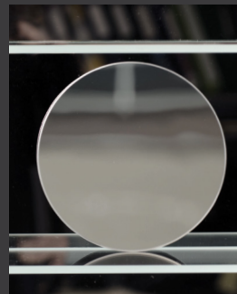
MAGNIFYING MIRROR (2.5 X)