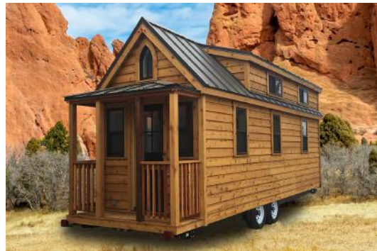
TINY HOUSE ON WHEELS UNDER 300 SQ FT

So the question is, is there still a surging trend for tiny homes? And if so, why does this trend exist and how has it evolved in the current real estate market climate?