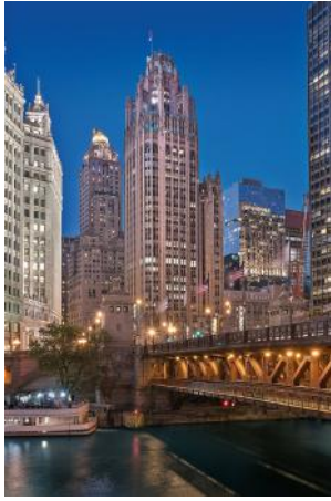
TRIBUNE TOWER RESIDENCES - Chicago, IL