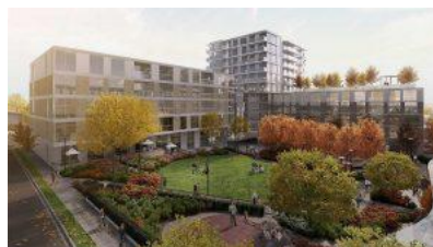
FRASER COMMONS - Vancouver, BC