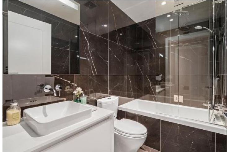
SMALL BATHROOM WITH RECESSED SIDLER DIAMANDO LIT MIRRORED CABINET - HEATHER & SEVENTEENTH, VANCOUVER, BC

For other areas of these micro-homes, creative storage can be implemented by building walls with hidden built-in storage compartments and by adding as much cabinetry in the kitchen as possible. And for smaller bathrooms in these micro homes, storage options such as mirrored medicine cabinets are a great design solution to address any storage space issues.