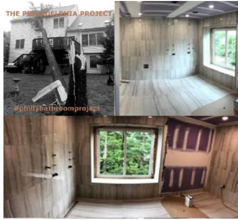
THE PHILADELPHIA BATHROOM DESIGN PROJECT! FOLLOW THIS STORY ON OUR SOCIAL MEDIA!