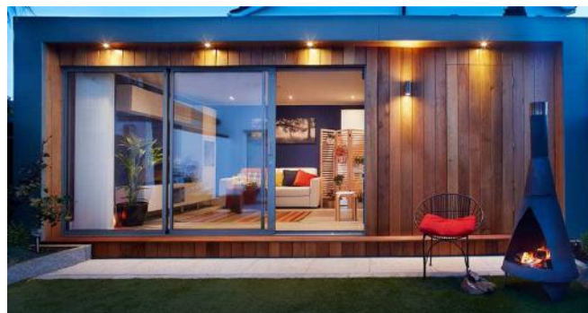
GARDEN HOUSE UNDER 800 SQ FT

This growing house trend since 2019 for laneway and garden homes, due to the high cost of real estate is a highlight story according to an article in the Vancouver Sun .