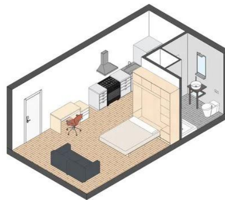
FLOORPLAN OF MICRO-APARTMENT

The other attraction of the micro-apartment is convenient and easy access to modern amenities and services such as a fitness centre, hair salon and coffee shop, which are all located on the ground floor of the apartment complex.