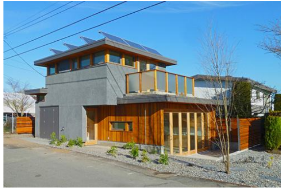
LANEWAY HOUSE UNDER 1000 SQ FT - VANCOUVER, BC