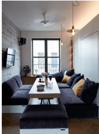
350 SQ FT MICRO-APARTMENT BY ARCHITECT GRAHAM HILL

As Jennifer Wen states, micro unit living does not mean there are compromises on luxury or functionality or storage or design. DWELL.com lists the top 19 micro-apartments across the globe , which reflects a finessed, stunning and creative design aesthetic with functionality.