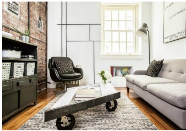
400 SQ FT MICRO-APARTMENT IN MANHATTAN, NY - DESIGNED BY THE NEW PROJECT GROUP