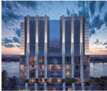
200 AMSTERDAM - New York, NY

Fraser Commons exemplifies modern and elegant city living situated along Vancouver's Fraser Street and Southeast Marine Drive. This development by Serracan Properties is a smart collection of 363 city homes, curated shops, a new daycare and generous green space featuring a huge, common use park for residents only. The development is made up of four beautifully designed buildings ranging from five to 21 storeys offer a wide variety of light-filled, air conditioned homes with 'European' inspired design, contemporary finishes and atmosphere.