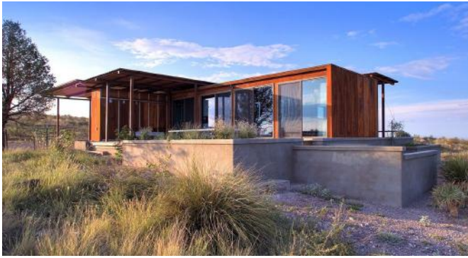
MICRO-HOME UNDER 1000 SQ FT

"small-house" movement within North America, which is an architectural and social movement advocating living simply in small homes. By 2012, these tiny homes eventually evolved into even smaller spaces as these 'homes on wheels' with under 400 square feet or even less in