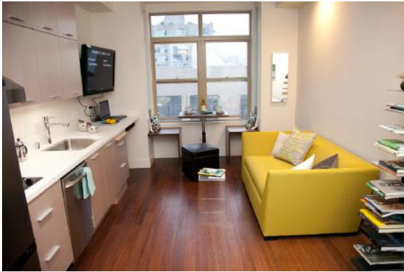
MICRO-APARTMENT IN SAN FRANCISCO, CA