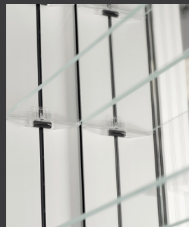
PATENTED SHELF ADJUSTMENT SYSTEM