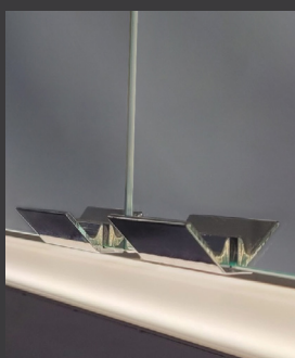
UNDERSTATED ALUMINUM HANDLE 45°