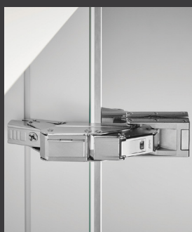
CONCEALED, BLUM® SOFT-CLOSE HINGES