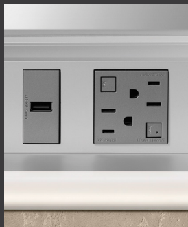
BUILT-IN GFCI OUTLETS & USB