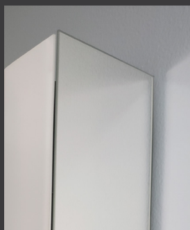
SIDE MIRROR KIT FOR SURFACE MOUNTING