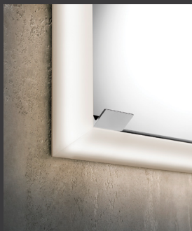
INTEGRATED LED LIGHTING SYSTEM