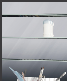
MIRRORED CABINET BACK WALL