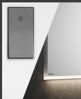
NIGHT LIGHT FUNCTION