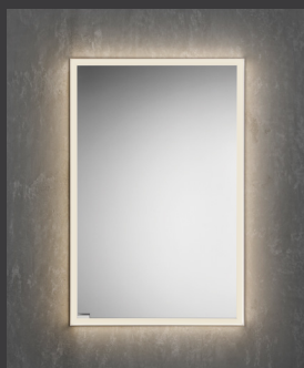
3000 K TEMPERATURE LIGHT (*DIMMABLE)