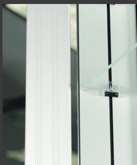
ANODIZED ALUMINUM BODY