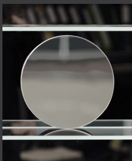
MAGNIFYING MIRROR (2.5 X)