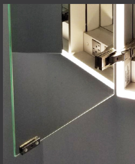
SILVERLASTING™ DOUBLE-SIDED MIRROR DOOR