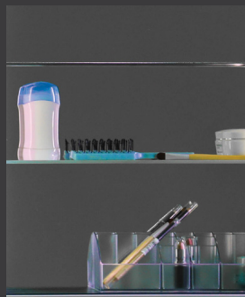
FUNCTIONAL STORAGE SOLUTION